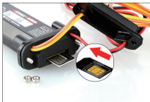
2.Plug-in SIM card (SIM card not include)