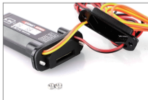
1.Unscrew the screw and open the lip